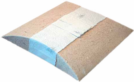
Journey Biodegradable by Eckels

Deep Water Biodegradable Natural Materials 12"W x 11"D x 3"H - 210 cu. In.