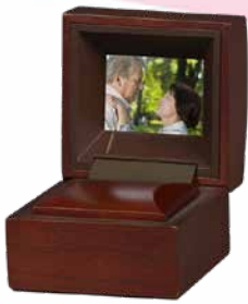
Tribute Keepsake by Eckels

Model 800-142 (Brass) or 800-143 (Silver) $