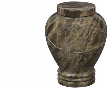
Tiger Eye by Eckels

Marble Construction Variety of Engravings Possible Engravings at No Charge 7.5"W x 10"H - 200 cu. In.