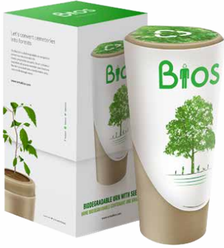
Back to Nature Bio Urn by Eckels