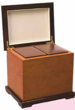
Harmony Companion by Eckels

Burlwood Construction Variety of Engravings Possible Engraving at No Charge 11.25"W x 8.75"D x 10.5"H - 460 cu. In.