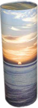
Eco Friendly Scattering Tubes by Eckels

Deep Water Biodegradable Multiple Designs available 5"Dia x 12.5"H - 200 cu. In.