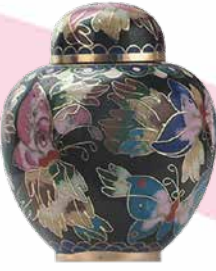
Sharing Cloisonné Keepsake by Eckels

Spun Copper Construction 2.75"W x 3.5"H - 2.5 cu. In.