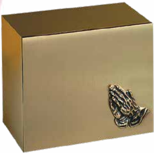
Bronze Together Companion by Eckels

Sheet Bronze Construction Appliques Available Engraving Available 9.5"W x 6.1"D x 8"H - 420 cu. In.