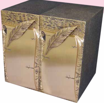
Scroll & Feather Companion by Eckels

Bronze/Zinc Construction Variety of Engravings at No Charge 4.6"W x 8"D x 8.6"H - 280 cu. In.