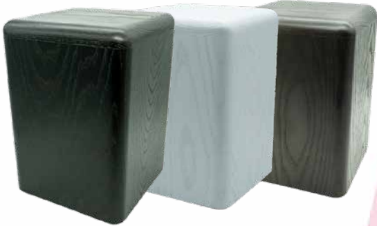
Ember by Northern

Ash Construction Available in Black, White, or Grey