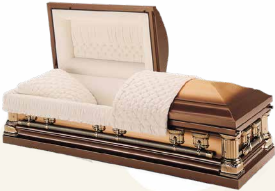
Aegean Copper by Batesville

Wood caskets can either be of solid construction, or made of select wood veneers. Most people who choose a wood casket do so because of the warmth and beauty of the wood. In fact, no two wood caskets are identical, since the graining patterns are unique to each one.