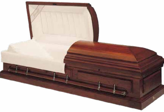
Langdon Cherry by Batesville

Solid Cherry Champagne Velvet Interior Non-protective