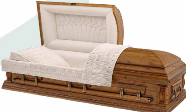
Cameron Oak by Batesville

Oak Veneer Champagne Velvet Interior Non-protective