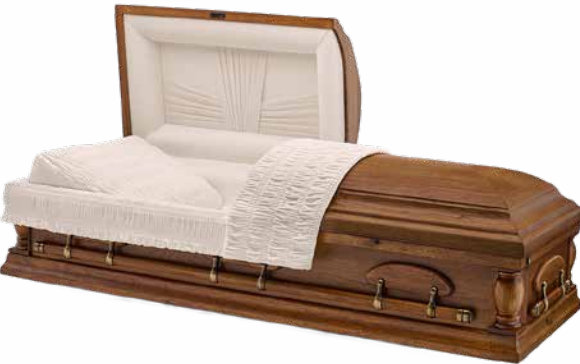
Woodhaven Pecan by Batesville

Pecan Veneer Champagne Velvet Interior Non-protective