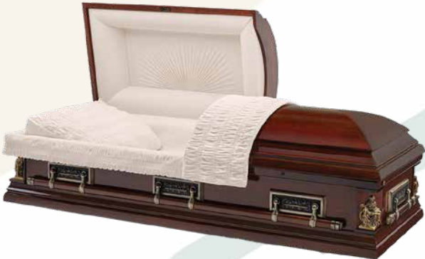
Sacramento Maple by Batesville

Maple Veneer Champagne Velvet Interior Non-protective