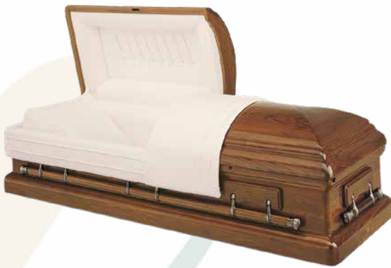
Seville Walnut by Batesville

Solid Walnut Champagne Velvet Interior Non-protective